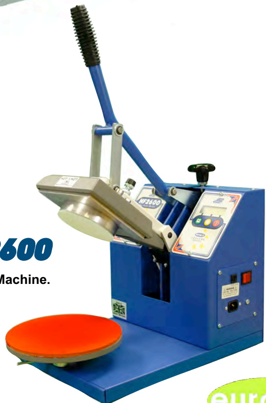
Plate & Tile Machine.